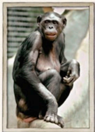
Bonobo Pan paniscus