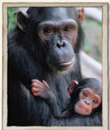
Chimpanzee Pan troglodytes

DNA reveals that humans share a common ancestor with apes, our closest living relatives.