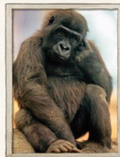
Gorilla Gorilla gorilla