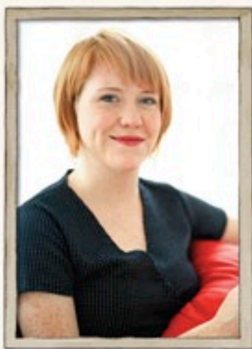
Human Homo sapiens